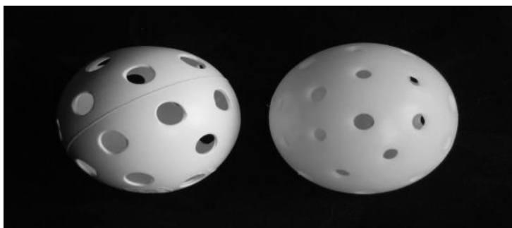
Figure 2-2. The Ball.

The ball pictured on the left of Figure 2-2 is customarily used for indoor play and the ball pictured on the right is customarily used for outdoor play. However, all approved balls are acceptable for indoor or outdoor play. The complete list of approved balls is on the IFP website.